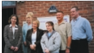
Doncaster MP Rosie Winterton visited the service to learn more about our work with offenders whose offences are drug-related.

We achieved 241, confirmation of the confidence the courts have in the order and the probation service's management of it.